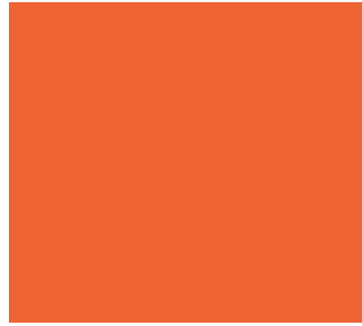
703 Orange RN