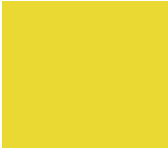
701 Yellow 4GN