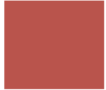
704 Red G